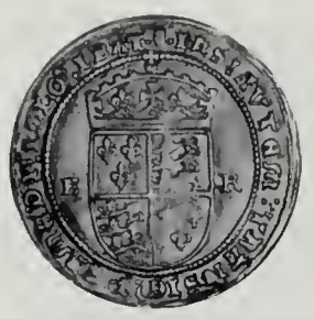
Lot No. 2835